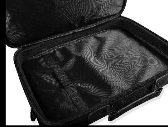
Lot of space