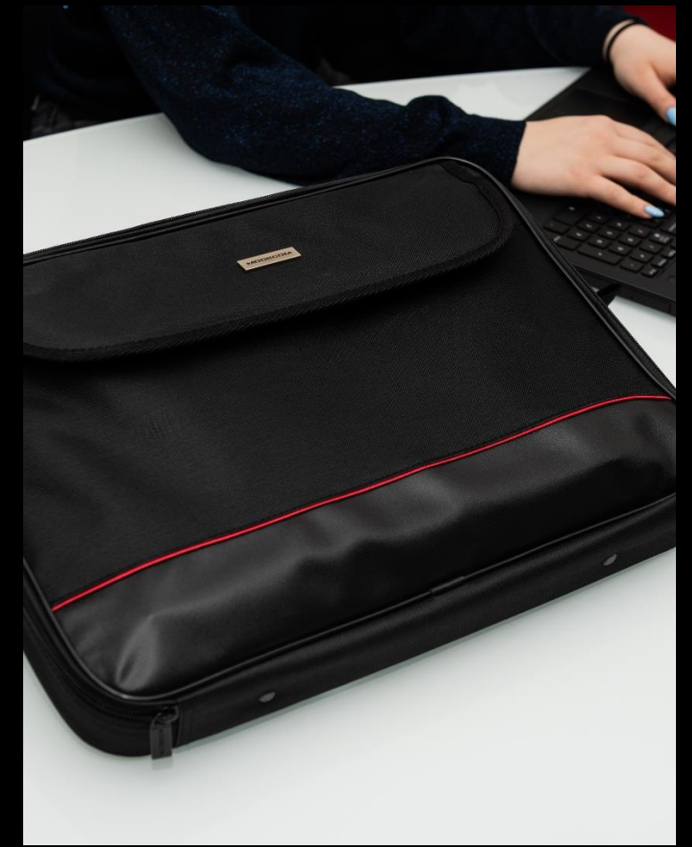
Perfect for work and study